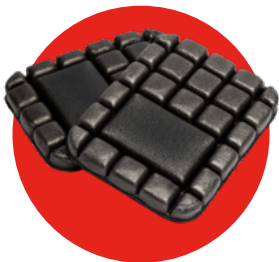
ELIDA 2358 Art. no. 2.12.358.02