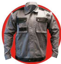
ERICK 2263 Art. no. 2.22.263.00